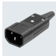
10A IEC (C14)